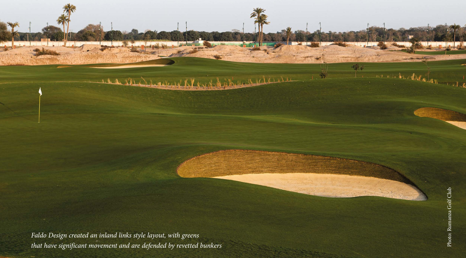
Faldo Design created an inland links style layout, with greens that have significant movement and are defended by revetted bunkers